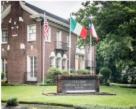
The Milford House, home of the Italian Cultural & Community Center.

We'd like to give our sincere thanks to all of our amazing members and friends who supported our 2023 Milford House Fund Campaign, which launched on Giving Tuesday on November 28, 2023. ICCC Houston would not be able to fulfill its mission to advance, celebrate, and preserve Italian culture and heritage without the incredible generosity of supporters like you.