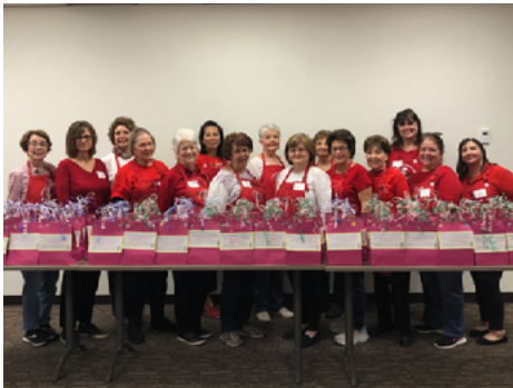
DOIH members prepare supply kits for women in need.