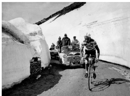
Charly Gaul, native from Luxembourg, engages a climb in a hairpin turn during the 1959 Giro d'Italia.

Flat and rolling stages tend to characterize the first week of the race, with a few smaller mountain stages thrown into the second week. The final week is often characterized by grueling climbing in the Italian Alps. It is during these climbs that the winner of the Giro d'Italia is often decided.