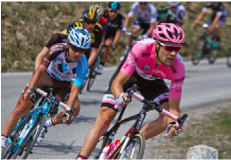
Giro d'Italia, 2017.

The 2024 Giro d'Italia, celebrating its 107th edition, will take off from Turin on Saturday, May 4 and end in Rome on Sunday, May 26, covering a total of 3,386.7 kilometers (2104.4 miles) across 21 days of racing. The Giro d'Italia, often referred to as simply "Giro," has gained a reputation for being one of the toughest races in the world, and its varied and beautiful routes across Italy have distinguished it even amongst the other great tours like the Tour de France and the Vuelta a España. But how did one of cycling's biggest events come to be?