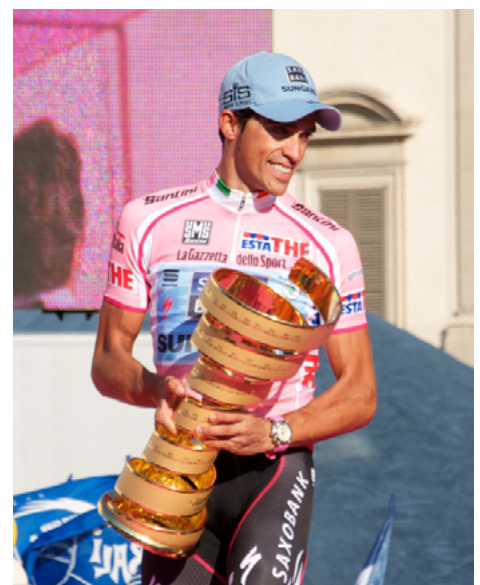
Alberto Contador celebrates his win of the Giro d'Italia wearing the maglia rosa, 2011.

Introduced in 1931, the maglia rosa (the pink jersey) is awarded to the rider leading the general classification, or in other words, the rider who has completed the stages so far in the quickest time, including any time bonuses. The jersey often changes hands several times throughout the race. The rider wearing the jersey after the final stage is named the overall winner of the Giro d'Italia. The jersey's color was selected because La Gazzetta dello Sport , creator of the Giro d'Italia, was printed on pink paper.