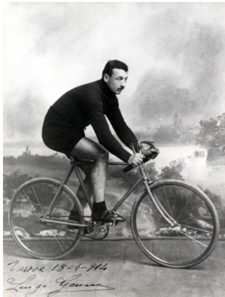
Italian racing cyclist Luigi Ganna, posing in a studio in Varese, Italy, 1914.

Luigi Ganna, who had placed fifth in the 1908 Tour de France, placed first in