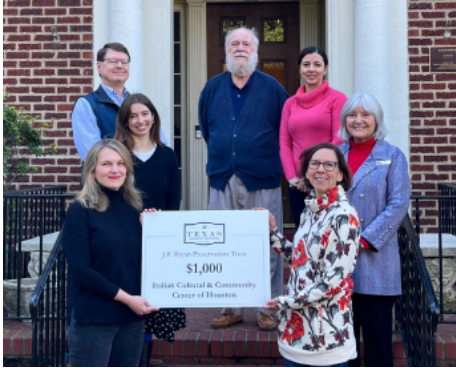
Texas Historical Foundation presents grant to Italian Cultural & Community Center, January 10, 2024.

A presentation of Texas Historical Foundation's recent grant to the Italian Cultural & Community Center of Houston took place the morning of Wednesday, January 10 on site at the historic 1923 Milford House.